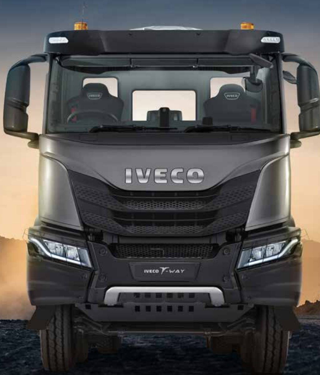
Illustration may contain optional features to the model.