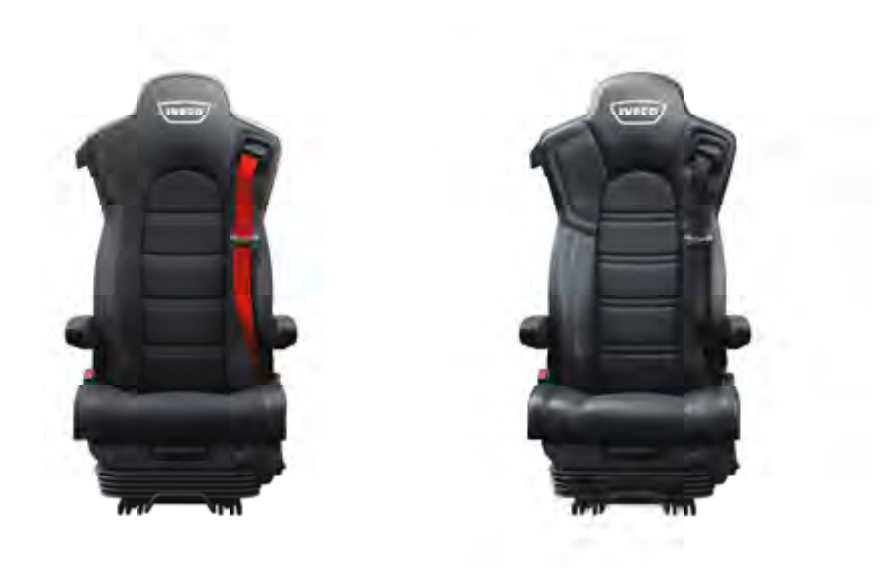
Customize your seats with fabric upholstery or vinyl and with the red seat belts, and enjoy luxurious comfort of the cushions

The entire driver area has been created to provide the ultimate driving environment with outstanding ergonomics and controls layout, more space and excellent visibility. Every single detail has been carefully studied to meet the driver's expectations on the road.