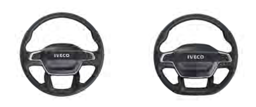
Choose the soft touch or leather steering wheel, both available in the classic shape or with the distinctive flat base