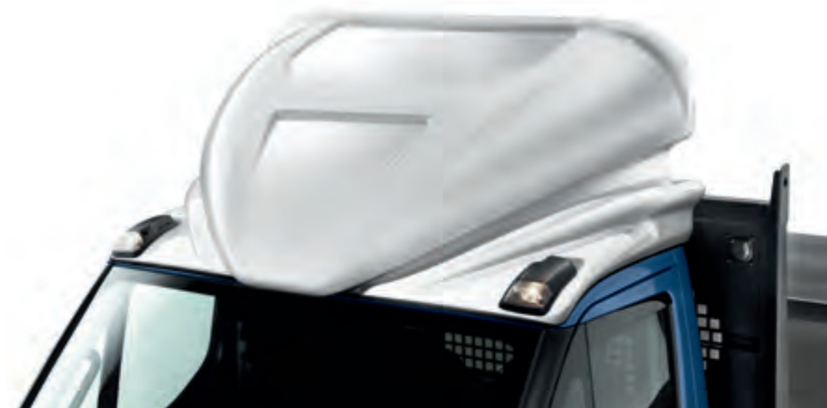
Roof spoiler sport line