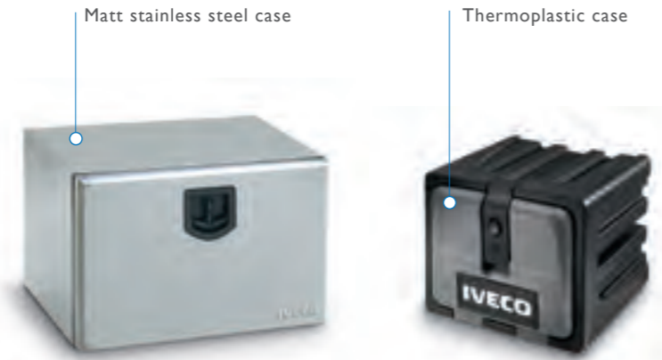
Matt stainless steel case

Made of medium-density polyethylene, it has an exclusive locking system with innovation double-release latch and "M.L.D." magnetic device preventing accidental opening. It comes with key and keyhole cap.