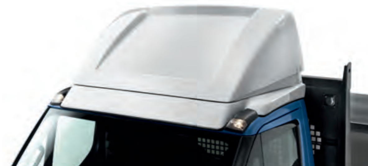
Roof spoiler standard line